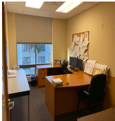
Executive Office with Glass Doors